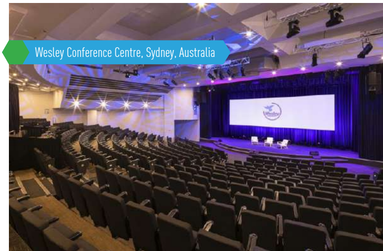
Wesley Conference Centre, Sydney, Australia